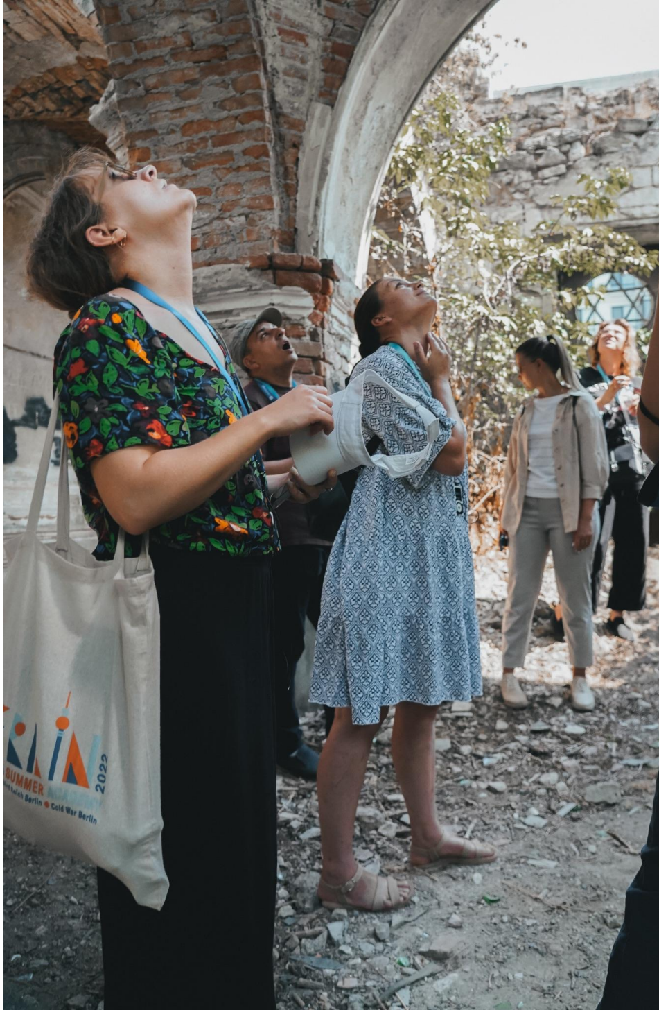
Tour of the cemetery