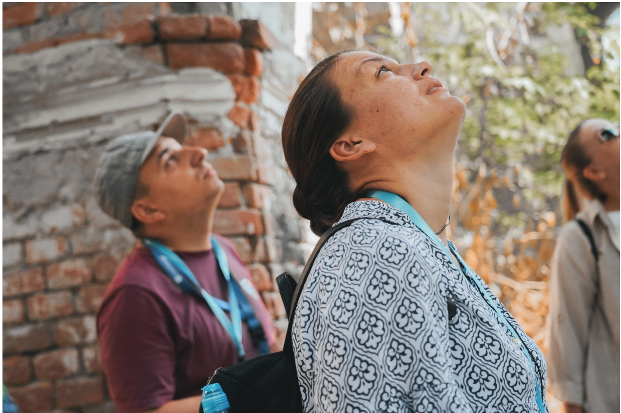
Tour of the cemetery