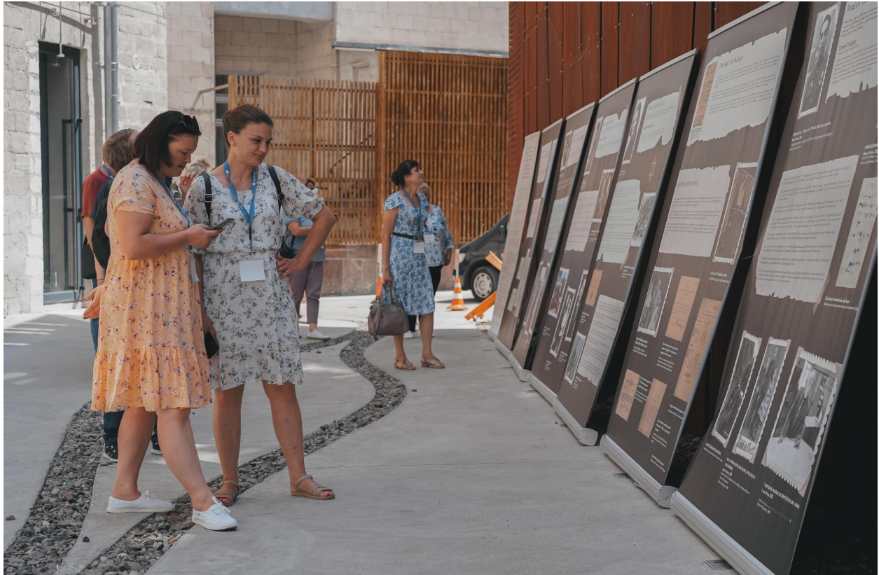
Participants visiting Centropa's new exhibition 'Fleeing the Holocaust: Jewish Refugees in the Caucasus and Central Asia'

This exhibition was created by Centropa and funded by the Eastern Partnership Program (OPR) of the Federal Ministry of Foreign Affairs of Germany and the Israeli Embassy in Georgia. The bilingual (Russian/Romanian) Centropa exhibition highlights several personal stories and shows archival documents related to the World War II evacuation from the Western areas of the former Soviet Union to Georgia, as well as through Georgia to Central Asia. It is based predominantly on the Centropa archive, using other documents from the National Archives of Georgia, the United States Holocaust Memorial Museum (USHMM) and Yad Vashem.